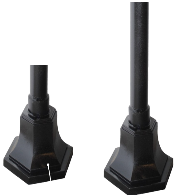
Door is 3 ½" x 6 ½".