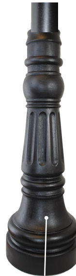
Door is 8 1/2" x 6".