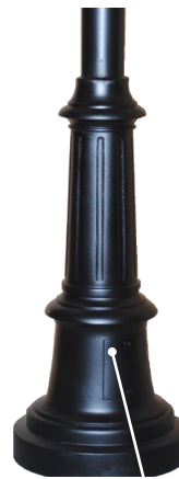
Door is 4" x 5 ½"