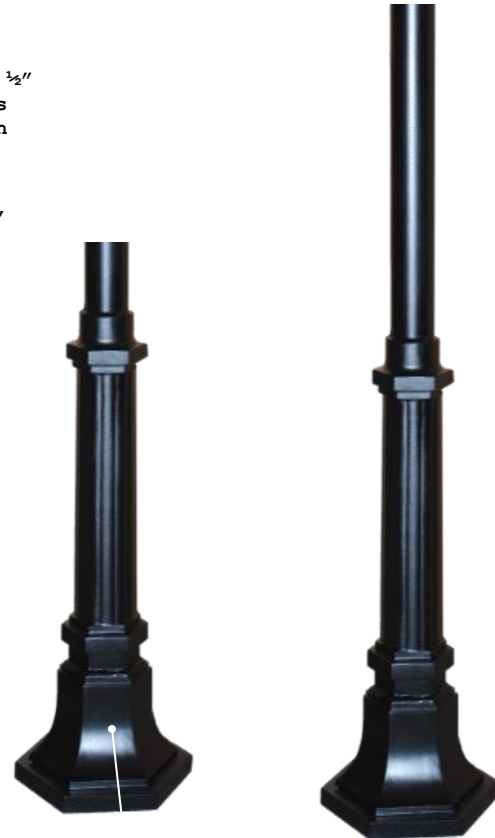
Bolt pattern 5½" cc.