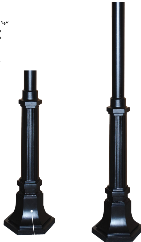
Door is 3 ½"x 6 ½".