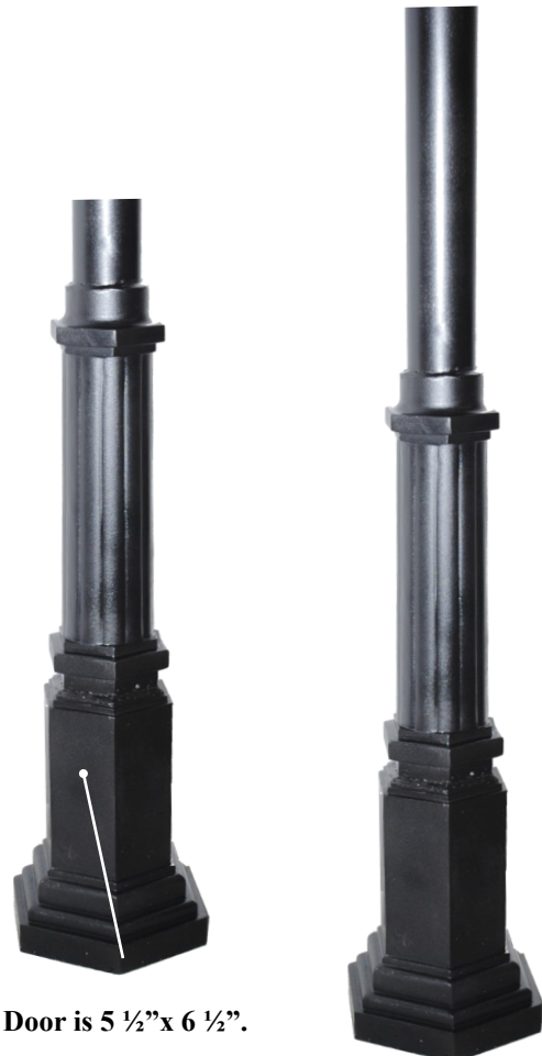
Door is 5 ½"x 6 ½".