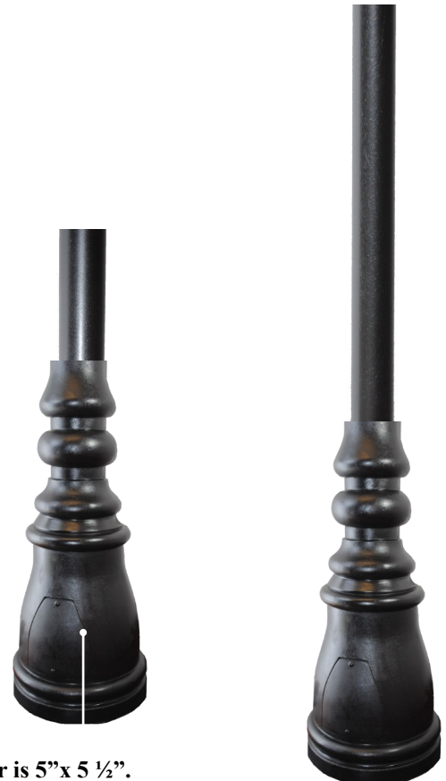
Door is 5"x 5 ½".