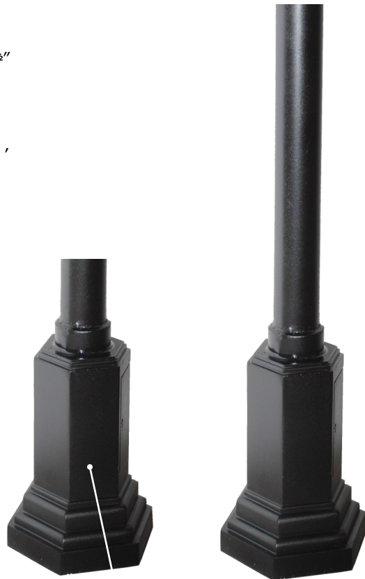
Door is 5 1/2" x 6 1/2"